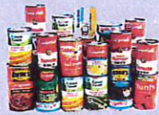
Aluminum & metal cans