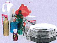
Plastic food containers & lids