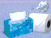
Kleenex, tissues & toilet paper