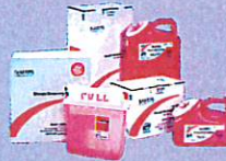
Medical supplies & sharps