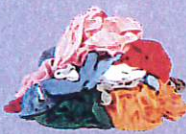
Clothing, textiles, & shoes