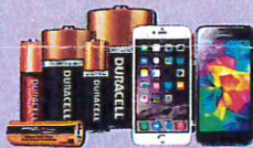
Alkaline batteries & cell phones (fire hazard)