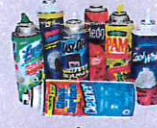
Aerosol spray cans (must be empty)